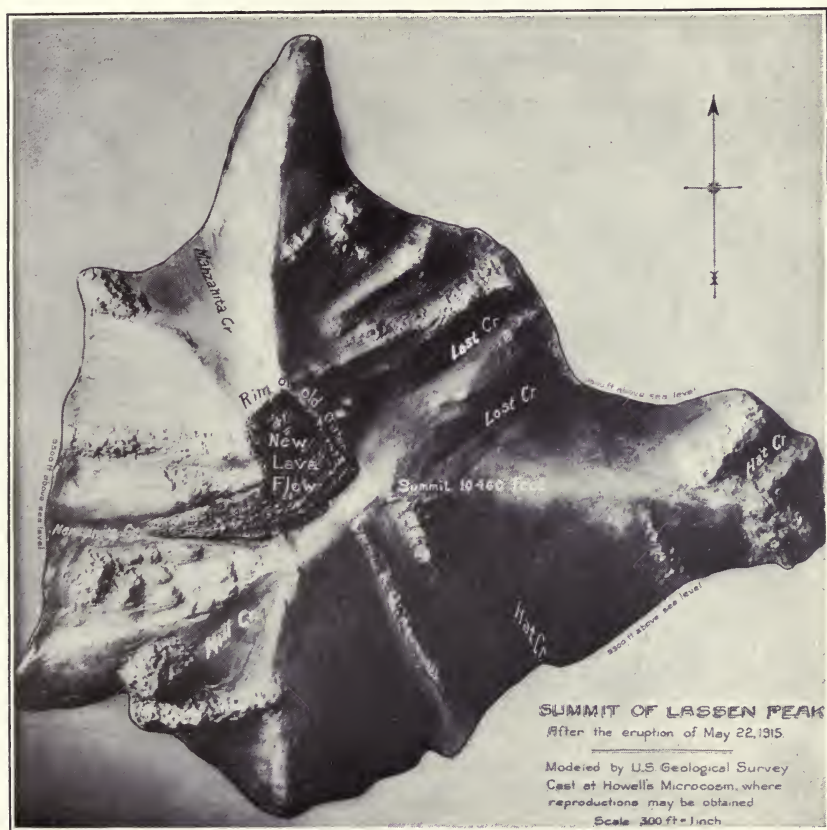
FIG. 3.—The upheaval of the bottom within the new crater began probably about April 1, 1915, and, continuing through April and early May, culminated in the great eruption of May 22, 1915, which resulted in the extrusion of a mass of new lava, so that it filled both the new and old craters to the rim as a "lid," and, overflowing through the notch, the new lava extended a short distance down the west slope. The hot blast that devastated the Hat Creek country escaped from beneath the edge of the lava lid at the head of Lost Creek.

bent load largely removed from the magma, it began to rise in the volcanic conduit and initiated the second stage, the effusive stage, of the volcanic activity. The hot magma apparently more or less viscous in the volcanic conduit, was forced upward by pressure of magma or gas from beneath and was gradually upheaved, with great escape of steam, until it reached the surface as new lava, and as a